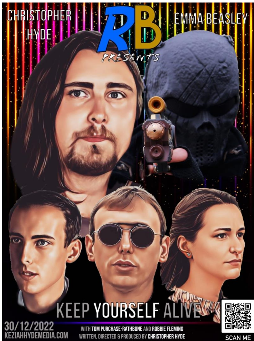
Official Poster for Reality Blows: Keep Yourself Alive (2022)

Creator and Chief Executive Creative Officer of Reality Blows